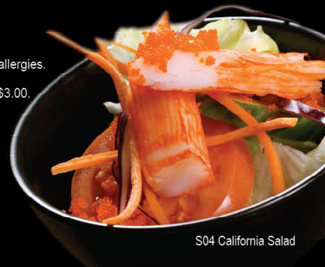
S04 California Salad

Prices are subject to change without notice.