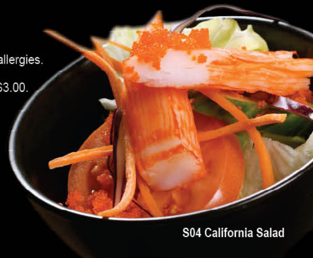
S04 California Salad

Prices are subject to change without notice.