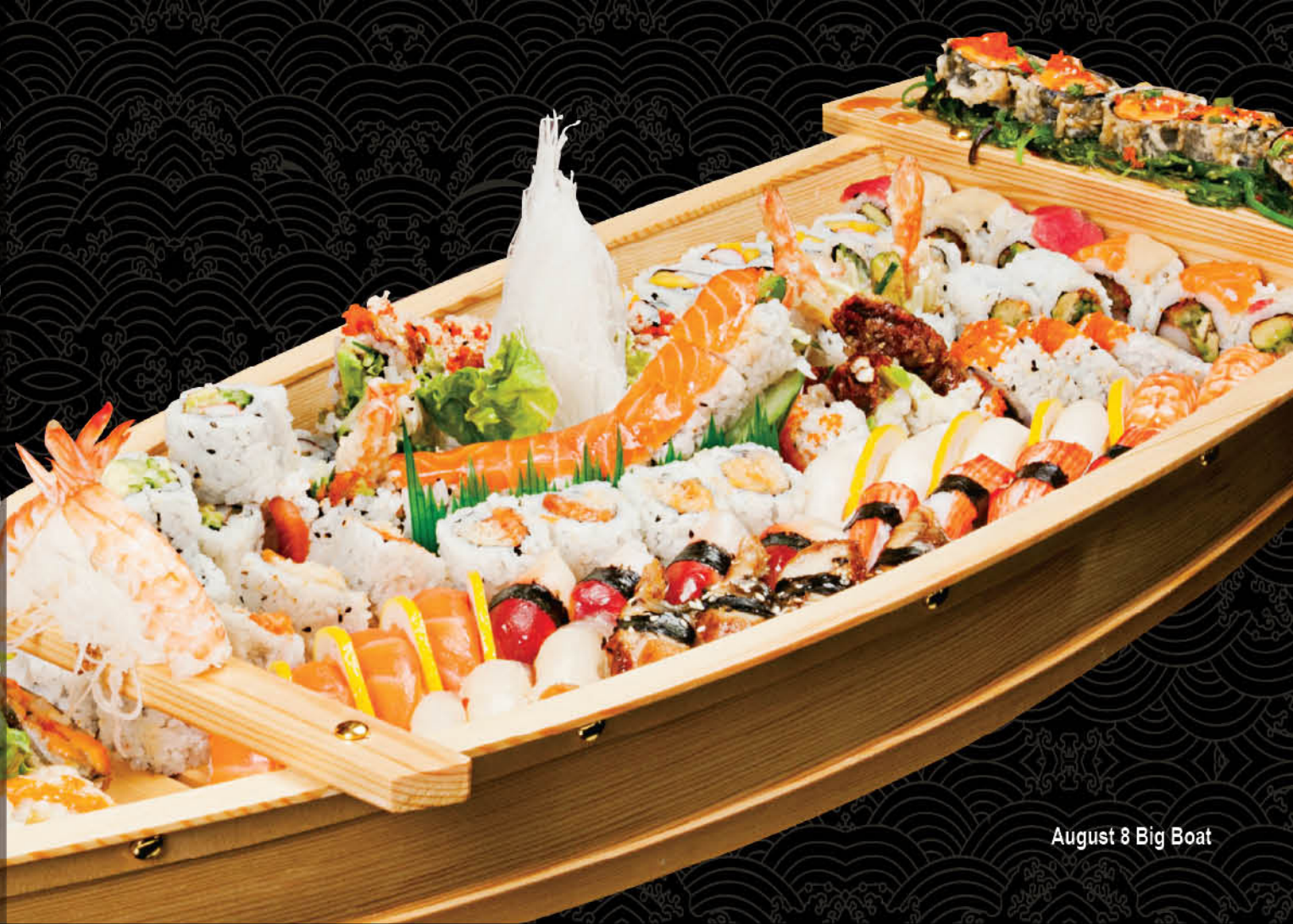
August 8 Big Boat

Burlington location 834 Brant Street, Burlington, Ontario L7R 2J5 reservation & order - tel : 905-633-8288